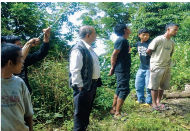
Skill developments programmes : On job training in North-East Region

These skill development projects have been undertaken in the sectors like Security, Telecom, BPO, Sales & Customer Care, Constructions, Electronics and Electrician, Financial Accounting, Ward Boy/Girl, Carpentry, & Plumbing etc. A total no of 59,860 beneficiaries were targeted to be trained and placed under the skill development programs across eight projects monitored by the school. Out of these, a total of 48,122 beneficiaries have already been trained and 39,239 beneficiaries have been provided with suitable placements till now.