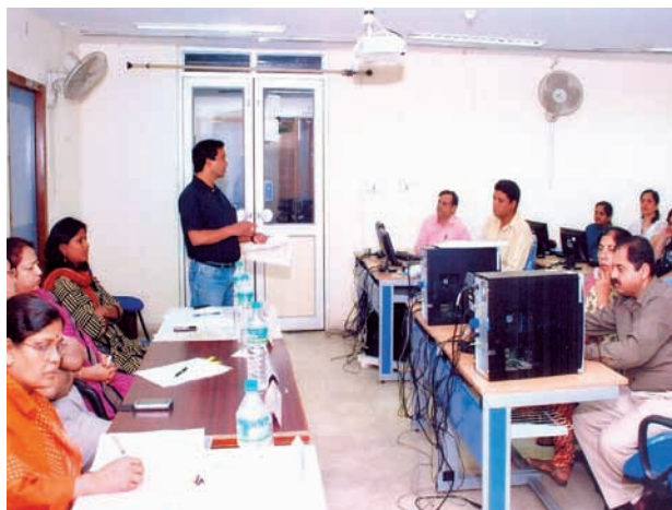
Participants and Resource Persons of the Workshop on post examination processes using new technology for DPAs/DEOs of SED, 07-18 May, 2012

STRIDE also provided training inputs for course writers of various Schools of Studies of the University. Besides, the faculty members have also acted as resource persons for training programmes organized by various institutions (DDEs/DTIs/SOUs) and outside IGNOU.