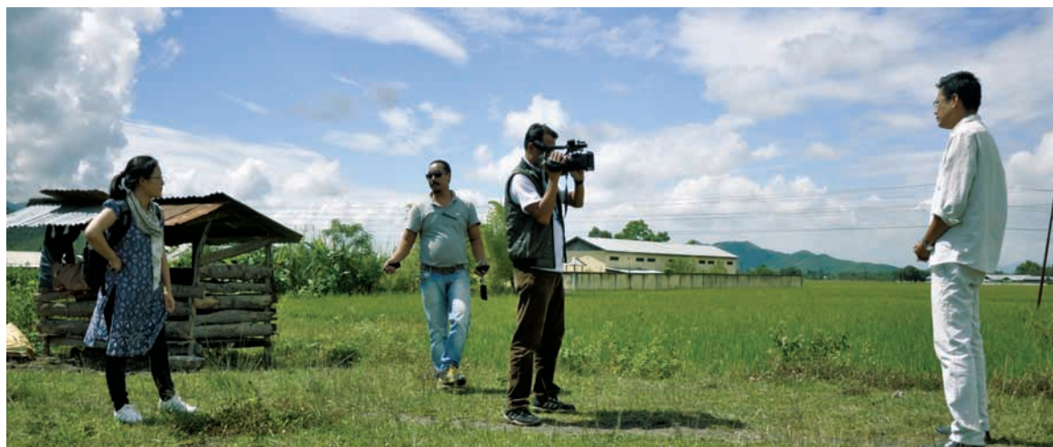
Production Team of EMPC on outdoor shooting

from 5 to 6 p.m. on Gyan Vani network. This is a bilingual programme in English and Hindi. The listeners from all over the country ask their queries related to legal aspects. The programme is very well received. In view of the popularity of the phone-in radio programme, the initiative was taken to launch the live television phone-in programme on Gyan Darshan. This programme "legal awareness for common people" is again a bilingual programme telecast on the 1st and 3rd Saturday of every month from 4 p.m. to 5 p.m. This programme is very popular among people.