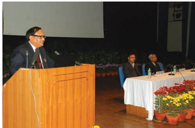
An orientation session on Right to Information Act

The RTI Cell of Administration deals with the matters of Right to Information Act, 2005. For proper implementation of the RTI Act and expeditious disposal of RTI matters within the stipulated time frame, the University has designated Public Information Officers and Appellate Authorities in all its Schools/Divisions/Centres/Units/Cells, Regional Centres and conducts RTI Workshops for them from time to time.