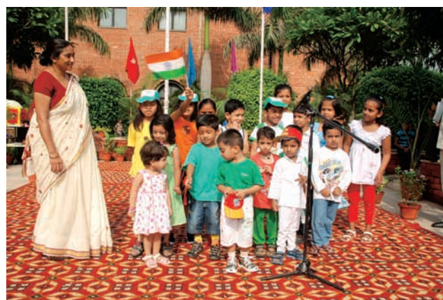
Children from IGNOU Creche performing during the celebrations on Independence Day at IGNOU