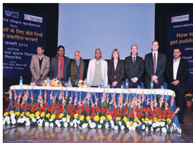
How to Write for and Publish in Scientific Journals – Author Workshop on 25 January, 2013