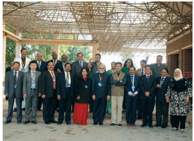
7th Annual Coordinators Meet of Overseas Partner Institutions