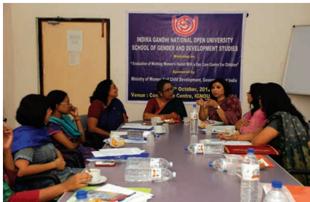
Workshop on "Evaluation of Working Women's Hostel sanctioned under the Scheme of Assistance for the Construction/Expansion of Hostel Building for Working Women with a Day Care Centre for Children" held on 06 th October, 2012.