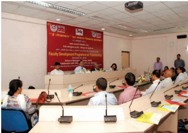
Faculty Development programme on – "E-Accounting"