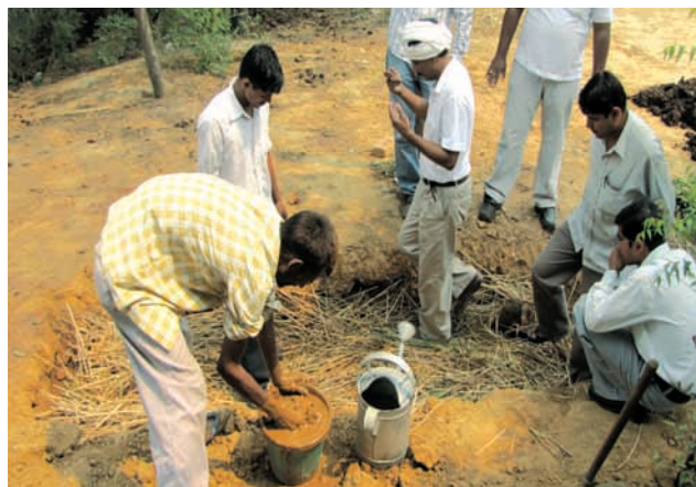
Students undertaking practical of COF

The main objectives of this programme are to impart knowledge and proficiency in organic production practices, certification process and marketing of organically raised agricultural products; and promote self employment and income generation.