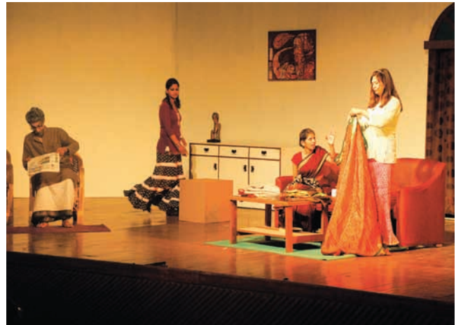
Drama Presentation organized by the School

Doctoral research focuses on individual creative practices, experimental work, historical studies, critical analysis, theoretical modeling. It may include mathematical or computational modeling and may engage into philosophical, psychological, socio-cultural or anthropological enquiry. Apart from the above interdisciplinary research is also encouraged. The Ph.D. Programmes have three specializations: Painting, Music and Theatre Arts.