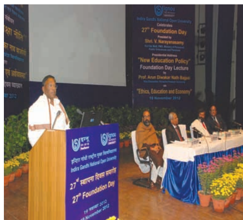
Sh. V.Narayanasamy, MoS, PMO, Ministry of Personnel, Public Grievances and Pensions delivering the presidential address on "New Education Policy" during 27th Foundation Day Lecture at IGNOU

We at IGNOU have identified several educationally and economically backward areas and started Programme Centres in these areas. This initiative helps many of those who are unable to pursue mainstream education. These are only a few examples of how IGNOU has impacted the lives of people. Our endeavours continue and we are constantly striving to live up to our mandate.