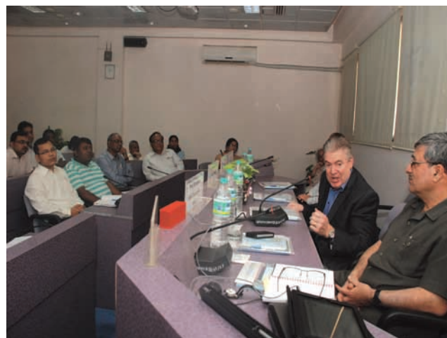
Delegation from the UK Open University with the Vice Chancellor and Faculty