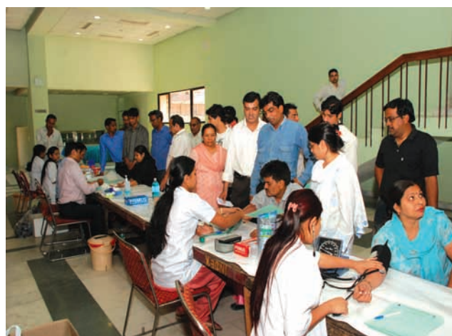
Staff of IGNOU during the Free Health Camp at IGNOU