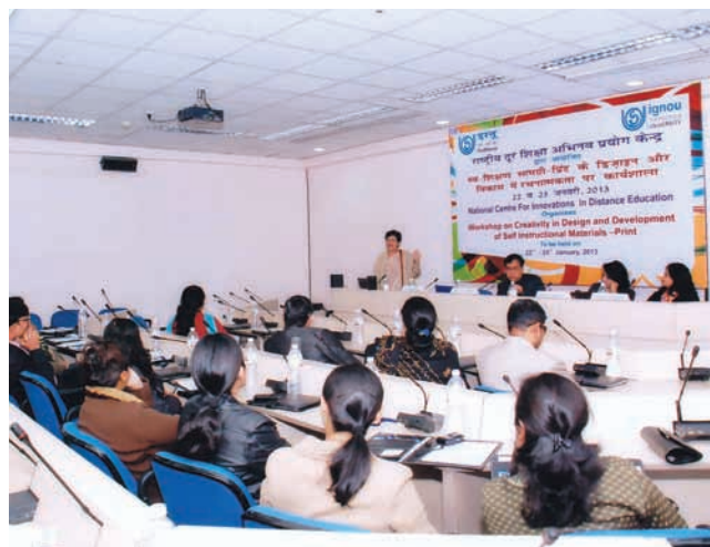
Workshop on Creativity in Design and Development of Self-Instructional Materials Print (22-23 January, 2013)