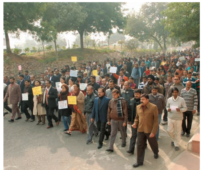
Candle March at IGNOU