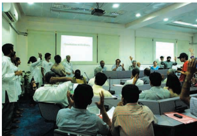
Orientation Programme on Deafness on 21st May, 2012 at IGNOU

The BA Sign Language Programme is unique since it is the first of its kind in India and in many parts of the developing world. IGNOU has committed to take all its programmes to the deaf students by using Indian Sign Language supported with appropriate Information and Communication Technologies as part of the National commitment towards inclusive education and the historic Right To Education (RTE) Act, 2010 passed by the Indian Parliament.