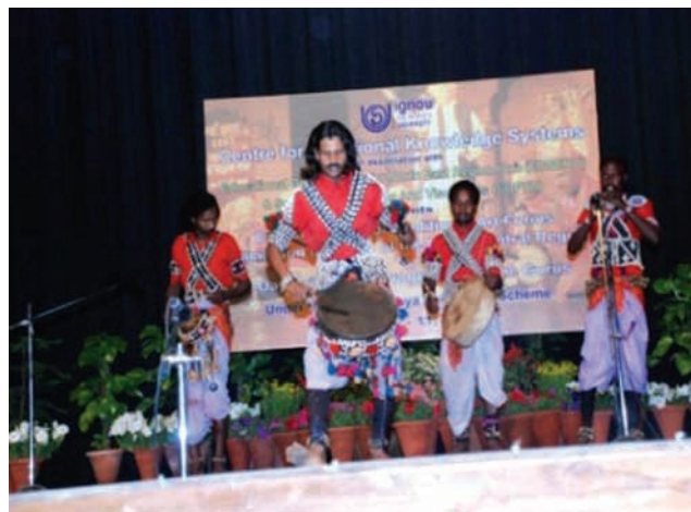
Demonstration of Indigenous Art Practices by Traditional Gurus

More than 100 students have been enrolled for the programme from the northeastern and north-central states of India.