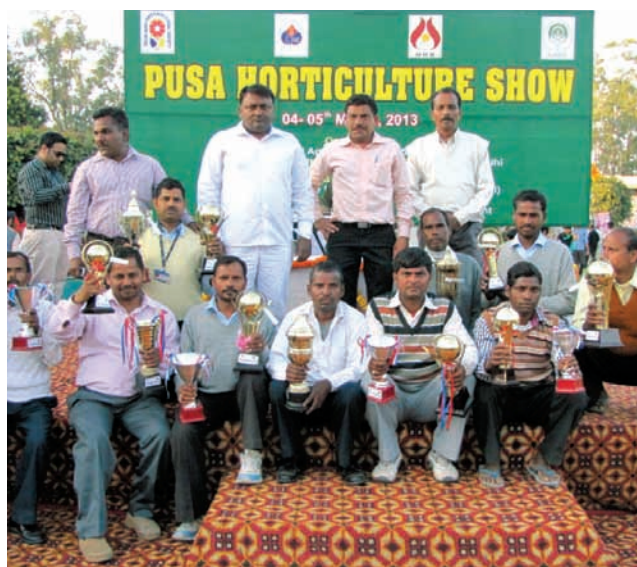
The Horticulture cell with 17 trophies won in Horticulture Show/competitions organized by Delhi Agri-Hort. Society (DAHS), Indian Agriculture Research Institute (IARI), Pusa, New Delhi

The Horticulture Cell landscapes, plants trees and other plant species for enhancing the greenery of the university campus which is spread over 150 acres. Throughout the seasons of a year, the cell grows different plant species in the campus to maintain its aesthetics. Many plant species are regenerated using the suitable plant propagation techniques and also sold for the resource generation. The available biodegradable biomass of the campus such as dried plant leaves, unutilized vegetables and other agro-wastes are being converted into organic manure through earthworm and recycled to maintain the fertility of the soil for avenue plants, lawns and vegetable cultivation. Exotic cut flowers such as gladiolus, tuberose, liliun, hyacinth, daffodils, tulip etc. are also grown during the winter season. Besides the vegetable crops, the cell also grows mushroom and first time button mushroom has been grown. Maintaining lawns, natural biodiversity and improving overall greenery of the campus are the main activities of the cell.