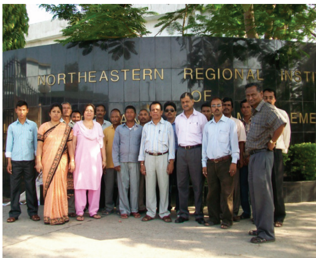
Training by ICRTA Agartala- Resource Person and Participants at NERIWIAM, Tezpur, Assam

Moreover, ICRTA, Agartala has published 22 Training Manual, on Agriculture and allied sector programmes conducted in NE states.