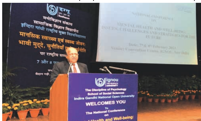
Inauguration of the conference

National Conference on "Mental Health and Well-Being: Issues, Challenges and Strategies for the Future" was organized by the Discipline of Psychology, School of Social Sciences, on 7th and 8th of February 2013. The Conference had paper presentations on sub-themes by experts from all over the country.