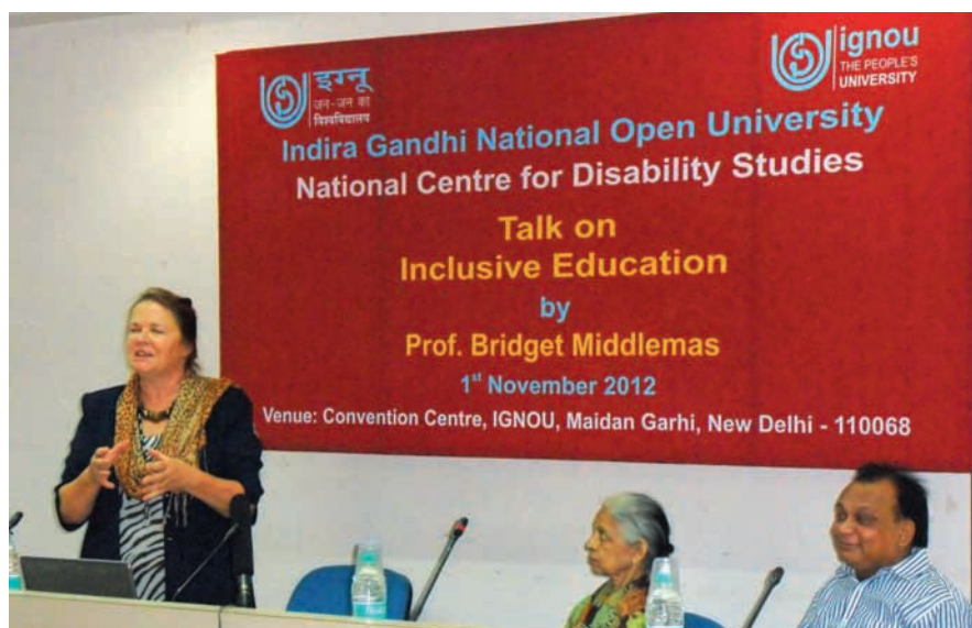
Talk on Inclusive Education

NCDS also provides scholarships to disabled students admitted to the Ph.D. Programme in IGNOU in various disciplines.