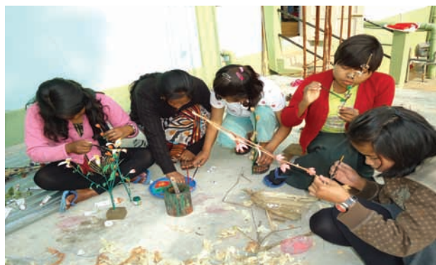
Training for Street Children in making crafts, flowers organized by IIVET Shillong and Shelter Home Shillong in December, 2011 to February, 2012

IIVET is using the e-learning mode as well. Hence, IIVET's activities are a judicious blend of distance learning and face-to-face modes. The emphasis is largely on training.