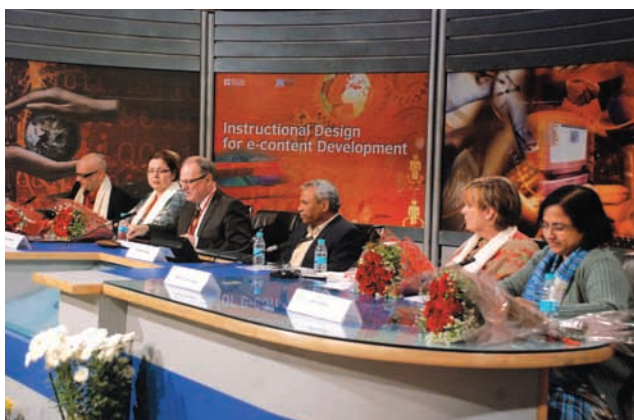
The Resource Persons of Workshop on "Instructional Design for e-content Development" interacting with participants at various Regional Centres of IGNOU. The Workshop was webcasted also. It was organized by IGNOU in collaboration with the British Council.

eGyanKosh is also running 27 online programmes completely through virtual mode right from registration to certification (visit www.ignouonline.ac.in/VirtualClass.htm for details). The team has developed its own learning management system to run the online programmes. The platform has integrated tools for question bank generation, course management, assignment management, online examination etc. In some of the programmes open source learning management system Moodle is also used. For real time interaction with learners, web conferencing tool Adobe Connect is used. The online e-learning platform has also been used for short term training programmes for training police personnel under the IGNOU- NHRC project and Block Level Officers under the IGNOU-Election Commission project. A total of 4394 students are pursuing these online programmes at present.