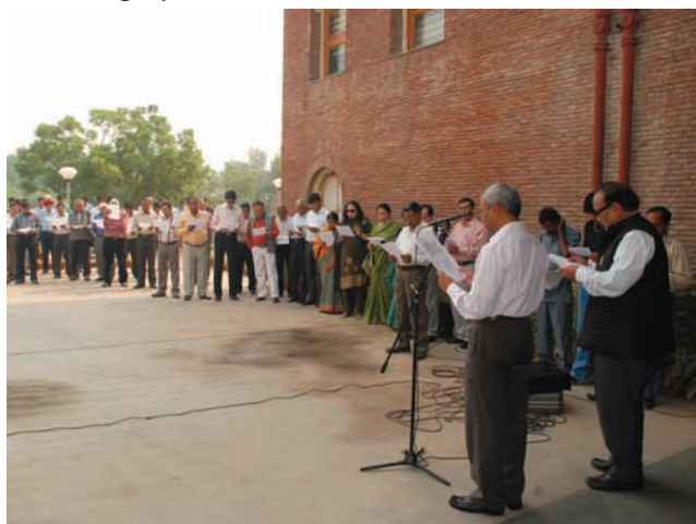
Vigilance Awareness Week 2012 was observed from 29th October to 3rd November, 2012. The week commenced with a pledge administered by the Vice-Chancellor to all staff members on 29th October, 2012