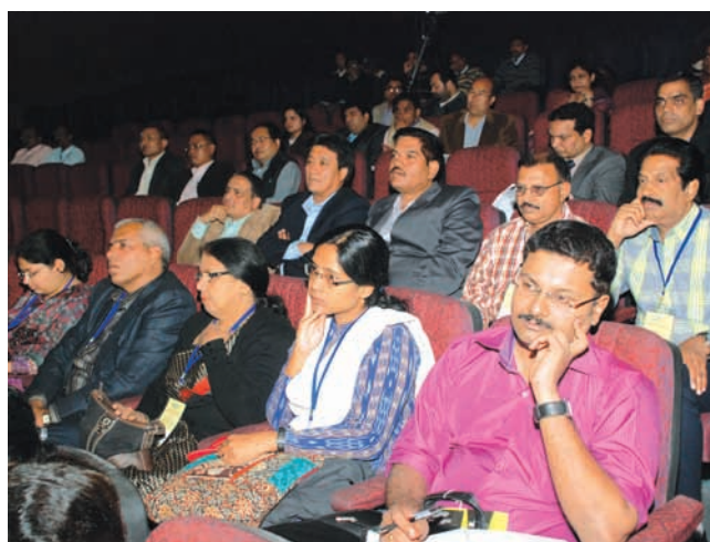
Regional Directors at the Inaugural of Brainstorming on Student Support Services