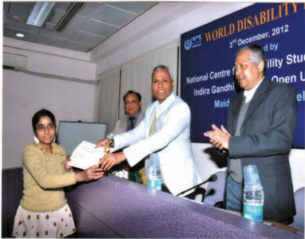
Prize distribution by the VC for slogan competition on disability during World Disability Day