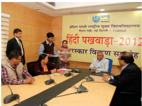
Prof. Gopinath Pradhan the then VC, addressing the staff on the occasion of "Hindi Pakhwada"

Rajbhasha Cell has been set up for monitoring the implementation of the Official Language Policy of Government of India. It organizes workshops for staff members to make them aware of the constitutional provisions regarding Hindi and to enable them to work in Hindi. The Cell inspects Regional Centres and Units in Headquarters to monitor the use of Official Language Policy of GOI. The Cell conducts quarterly official language implementation Committee meetings under the Chairmanship of the Vice Chancellor to review the progress of use of Hindi. Hindi classes for non Hindi staff members are being conducted in campus. Hindi typing/shorthand training is also being imparted with the help of Hindi Teaching Scheme of Ministry of Home Affairs.