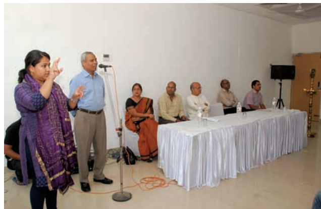
1st Foundation day of ISLRTC at IGNOU campus