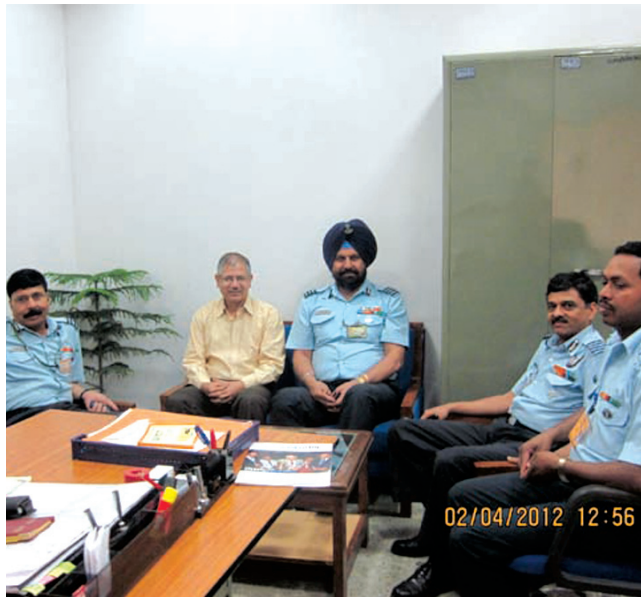
Officers of the Air Force at a discussion in Defence Unit

Project 'Akashdeep' was undertaken for recognizing the Basic and In-service training imparted to the airmen and Non-Combatants Enrolled NCs (E) of the Indian Air Force for award of civil qualifications. It is aimed at fulfilling the long-standing desire of the IAF to get civil recognition for the knowledge and experience gained by the airmen and NCs (E) while they are in service. Online Registration of airmen and Non-Combatants Enrolled NCs (E) for award of Certificates, Diplomas and Associate Degrees under the Project Akashdeep was done. A total of 49,692 airmen have completed online registration.