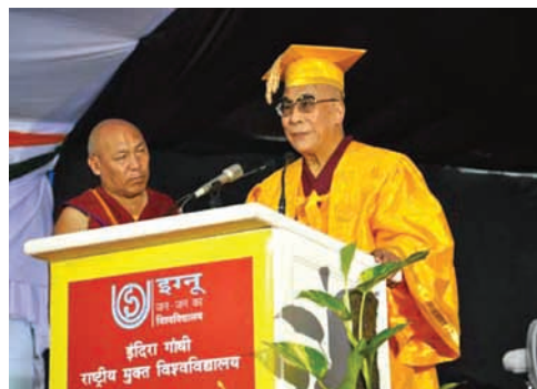
His Holiness the Dalai Lama delivering the 24th Convocation address

Proportionate weightage is given to the various components for calculation of the final grade. Also, as regards the summative evaluation, IGNOU now offers the scheme of On-Demand Examination for a few programmes to provide an opportunity for learners to take up the examination when they feel they are ready for it.