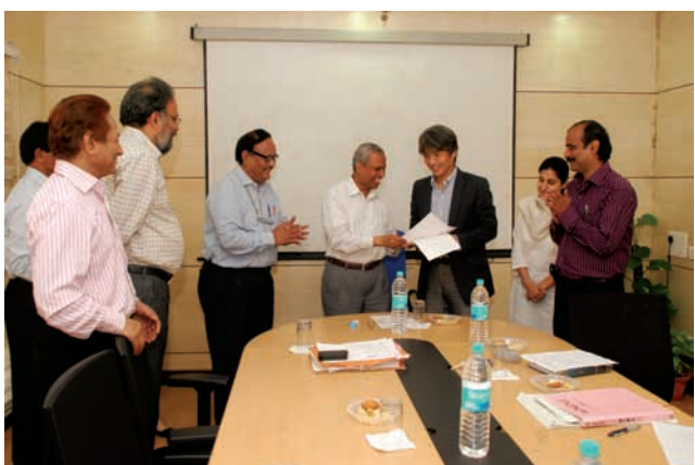
Exchanging the MoU with JICA, Japan