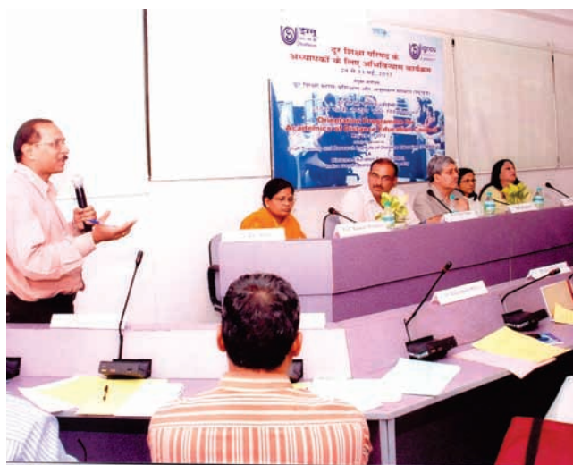
Participants and Resource Persons at the Orientation Programme for Newly Inducted Academics of DEC, 29-31 May, 2012

The STRIDE conducted training and refresher programme for officers of the University at different levels. Orientation programmes were also organized for newly recruited Academic staff. A large number of counselors were provided orientation through programmes conducted at 30 Regional Centres all over the country.