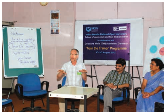
One of the sessions of the Training Programme

The School organised its fourth international training programme 'Train the Trainer' in collaboration with DW Akademie, Germany during 6-14 August, 2012. The programme was designed to enhance the training and professional skills of the participants drawn from academia, NGO and corporate sectors.