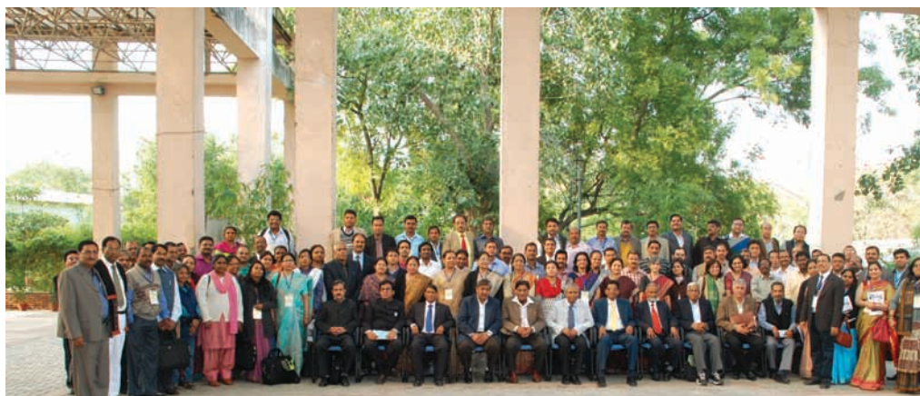
Regional Directors along with other officials of the University

Learners who successfully complete the prescribed credits in a particular programme are awarded certificates/diplomas/degrees at the Convocation, which is usually held in March/April of every year at the University Campus, and at select regional centres simultaneously through the teleconferencing mode. Some of the overseas partner institutions conduct degree award ceremonies separately. Gold medals are also awarded to toppers who have completed a programme of study in the minimum prescribed period in all diploma and degree programmes of the University.