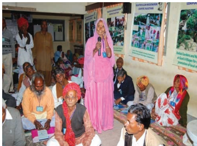
Accreditation and Certification of Prior Learning for Traditional Health Practitioners

360 Traditional Health Practitioners have been assessed for their Prior Learning from the states of Karnataka, Tamil Nadu, Chattisgarh, Odisha, Rajasthan and Gujarat for jaundice, bone setting, common ailments, poisonous bites, rheumatoid arthritis based on the Minimum Standard of their Competency.