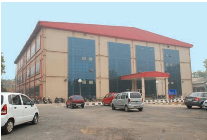
New Academic Block for Schools

There are 21 Schools of Study (details of which follow in later chapters) where the academic programmes are conceptualised, designed and developed.