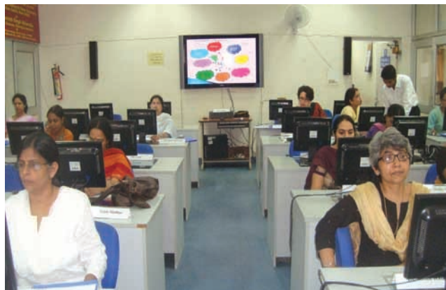
Training Programme on "Development of Multimedia E-Content using Open Source Tools" during 5th - 7th September, 2012