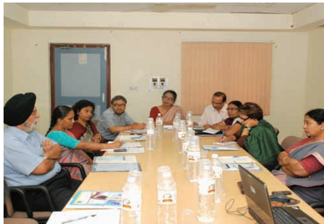
Expert Committee Meeting for PG Certificate/ Diploma in Gender, Agriculture and Sustainable Development being developed in collaboration with School of Agriculture held on 11 th & 12 th October, 2012

The School envisages major initiatives in research, teaching, training and advocacy in the areas of gender and women's studies as well as gender and development studies.