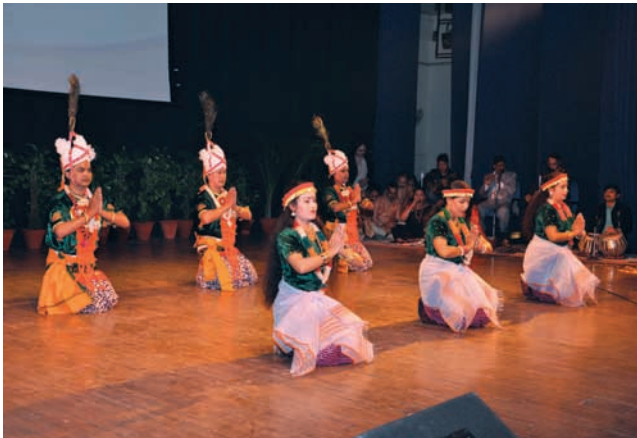
Dance and Music Programme courtesy Song and Drama Division, Government of India organized by IGNOU Literary and Cultural Forum (ILCF) at IGNOU