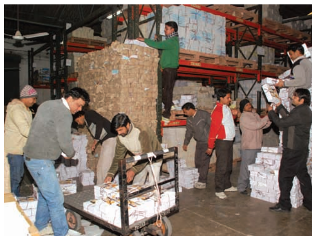
The learning material being loaded at the Warehouse

The Marketing cell looks after the sale of study material to the general public and educational institutions through spot sale at the headquarters. IGNOU study material is also sold through 15 retail agents in different parts of the country. In order to help needy students and resolve their queries related to non-receipt of study material and assignments, the Student Support Cell of the division attends to them through e-mails and telephone.