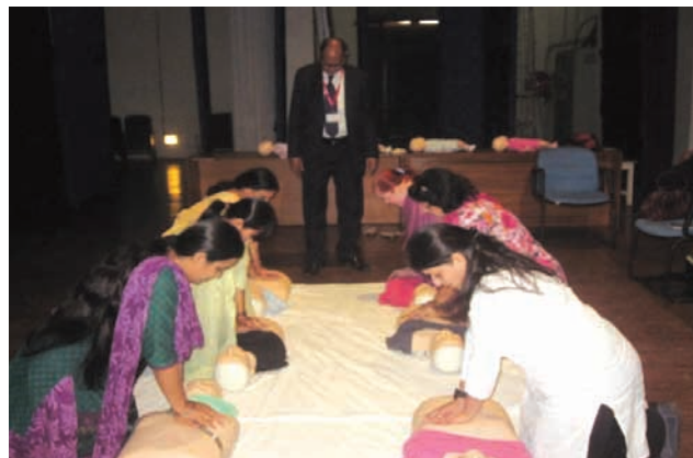
Training Workshop on Resuscitation and First Aid

A one-day training workshop on Resuscitation and First Aid was organized by the School of Health Sciences in collaboration with PHOENIX Institute of CPR Defibrillation which is an authorized AHA (American Heart Association) training centre in Delhi.