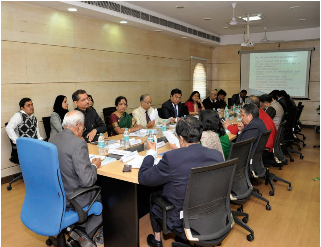
National level committee on Maintenance of Quality in Distance Education, constituted by Chairman, Distance Education Council (DEC) held on 8th February, 2013 at IGNOU

The Council is at present working for the promotion of systemic research in identified thrust areas in distance education; facilitating joint development and sharing of courses/programmes between institutions; and development of norms for offering online