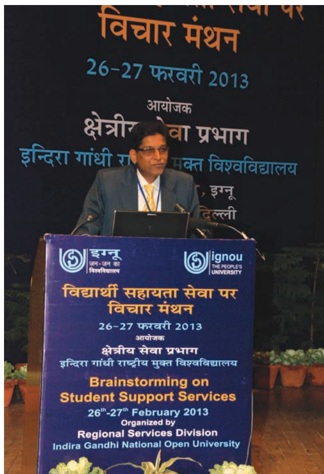
Director, RSD addressing the Regional Directors