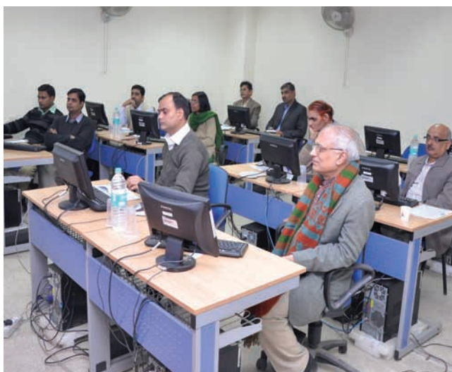
Faculty undergoing training on MATLAB as a Research Tool on 4-5 December, 2012